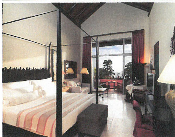
CLOCKWISE FROM TOP LEFT: The Verona Restaurant; relaxing in the Spa Sauna; a double room in one of the villas; the golf course commands stunning views.

Just as a book cannot be judged by its cover, first impressions of The Abama can be misleading. At first glance you might be taken aback by the initial appearance of the resort and wonder if you have taken the wrong turn. I still remember driving towards this large, pink, Moroccan-inspired resort and its turreted towers with some trepidation – now we crane our necks to see who will be the first to glimpse the terracotta citadel on the horizon.