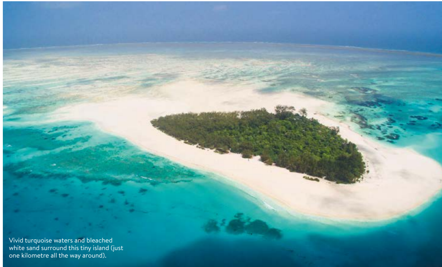
Vivid turquoise waters and bleached white sand surround this tiny island (just one kilometre all the way around).