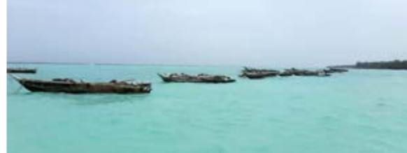
Sun, sea and sand – most activities on Mnemba involve the ocean, from sundowner cruises to kayaking and snorkelling and learning to scuba dive

After landing at Zanzibar airport on the main island of Unguja, we drove for a couple of hours through the spice