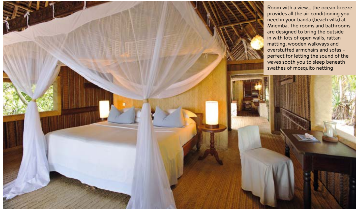
Room with a view... the ocean breeze provides all the air conditioning you need in your banda (beach villa) at Mnemba. The rooms and bathrooms are designed to bring the outside in with lots of open walls, rattan matting, wooden walkways and overstuffed armchairs and sofas – perfect for letting the sound of the waves sooth you to sleep beneath swathes of mosquito netting