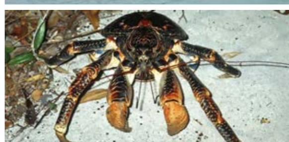
The alien-like and rare, gigantic, tree-climbing coconut crab lives in deep burrows in the island's forest. It's the world's largest land living arthropod and we were privileged to catch a glimpse of two of the four who live at Mnemba