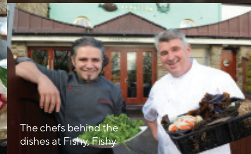
The chefs behind the dishes at Fishy, Fishy