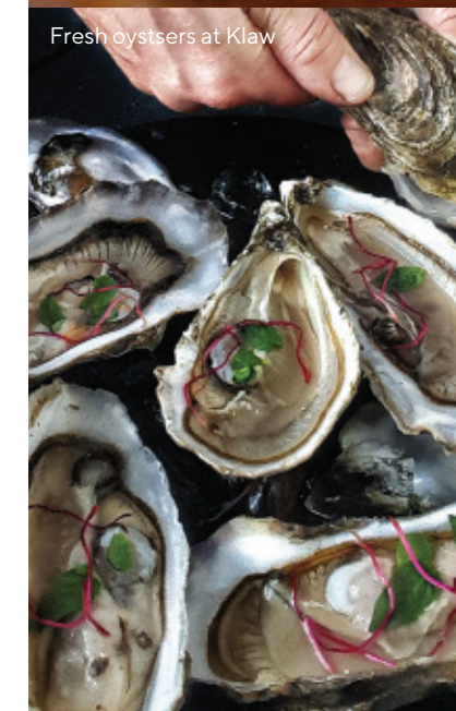
Fresh oysters at Klaw