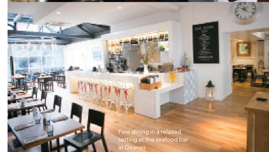
Fine dining in a relaxed setting at the seafood bar at Deanes