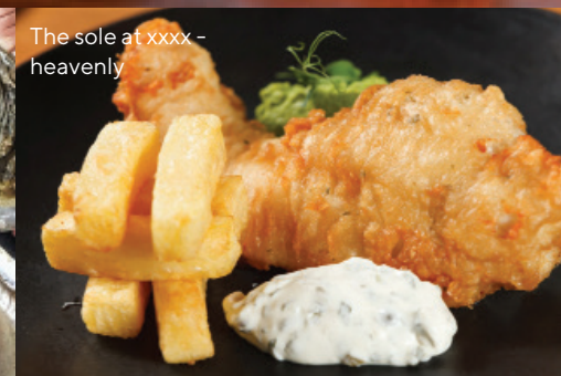
The sole at xxxx - heavenly