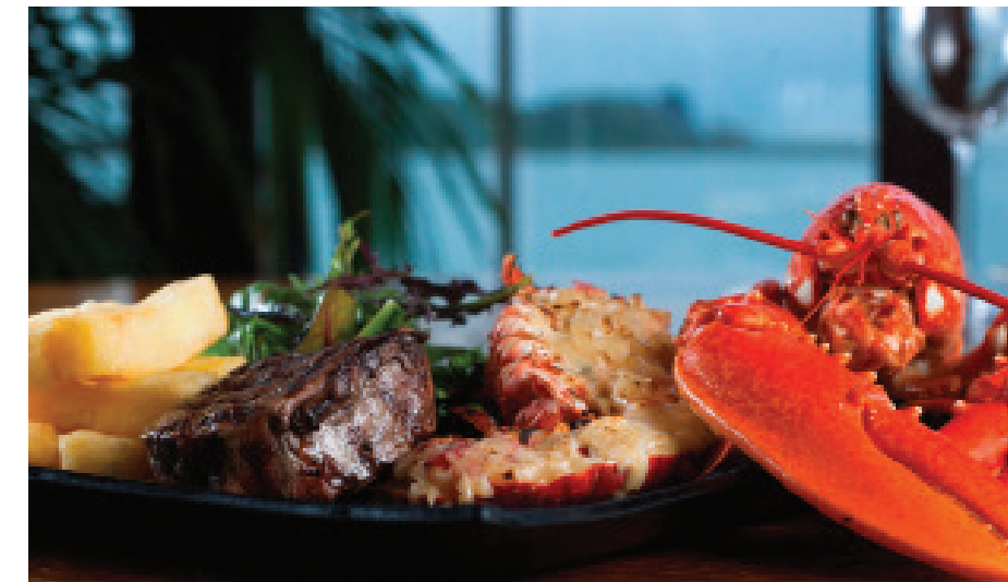
Surf and turf at Howth eatery Aqua